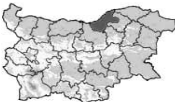
Figure: 2 Rouse region (Bulgaria)

The survey was implemented on the basis of a prior drawn organizational plan, which specifies the units and the period of the survey, the method of recording and presentation of data, the forms of organization of the survey, the place of the survey, the likelihood of admission of errors etc. The sample consisted of small and medium enterprises from different sectors, which are situated in Ruse, Northeastern Bulgaria (see Fig. 2). Units of the survey have been 50 companies. The crucial moment for the survey was 01.04.2009 and the applied forms of organization were the self-survey and the correspondence form, in which data had been collected by means of a questionnaire within a certain deadline with a preventive logical and arithmetical check.