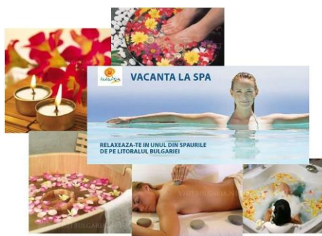
Figure 7 SPA centers promotion

following to promote the construction of golf fields, haunting spaces, beauty clinics, SPA services and not at least, five star hotels.