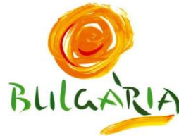
Figure 1 Bulgaria's logo

The rose was drawn as a scroll and the position and colors could symbolize a sun rising above the earth. The right line of R letter represents a part of the flower's stem and the horizontal line under „Bulgaria” symbolizes the earth 1 .