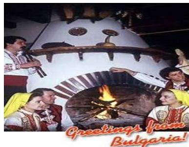
Figure 2 Rural tourism promotion

The Tourism State Agency from Bulgaria hopes that, emphasizing on the eco-tourism and the rural tourism, to permit the country to diversify the offers and to obtain a new image. It is desired that on long term the eco-tourism to become a tool of rebirth of the mountainous and rural areas, a large part of them being neglected.