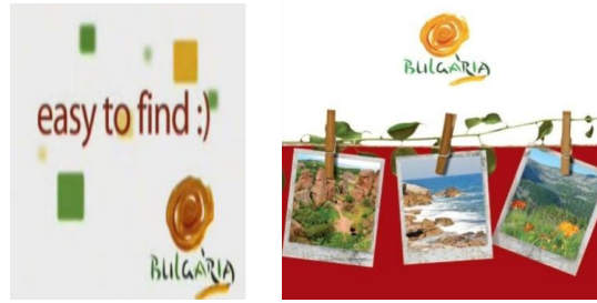
Figure 5 Promotional posters

➤ TV commercials. Starting from the 13 th of March, 2008, CNN broadcasted three spots for the promoting of Bulgaria 1 . One of the clips focuses on the casinos and the beaches, promoting Bulgaria as a destination for entertainment. The other two spots underline the opportunities offered by ecotourism and cultural tourism. These three spots (the first with a duration of 40 seconds, the other two 20 seconds each) were developed by CNN at the request of and using the materials provided by the State Agency for Tourism. The three clips were broadcasted for 8 weeks during the months of March, May, June and September.