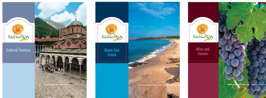
Figure 3 Bulgaria`s offer

Winter sports. In the last year Bulgaria won popularity as one of the most promising winter touring destinations in Europe due to the excellent natural riches, convenable infrastructure from the mountainous resorts, modern hotels, according with the European quality standards of quality and quality services. The biggest ski resorts in Bulgaria are: Bansko (Pirin Mountains) which is considered the most modern ski center in South Eastern Europe, Borovets (Rila Mountains) and Pamporovo (Rodopi Mountains).